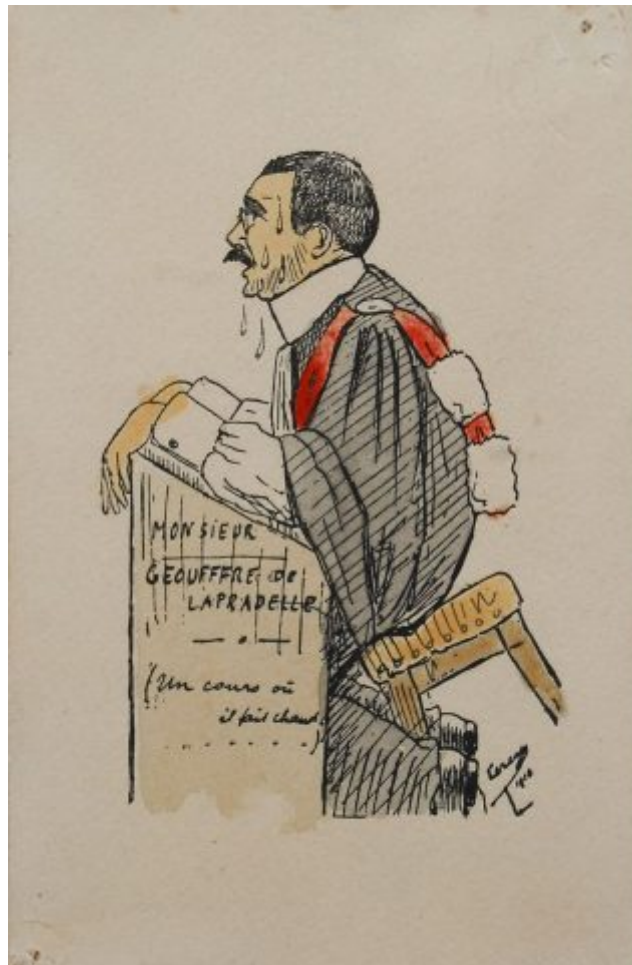
Portraits of professors